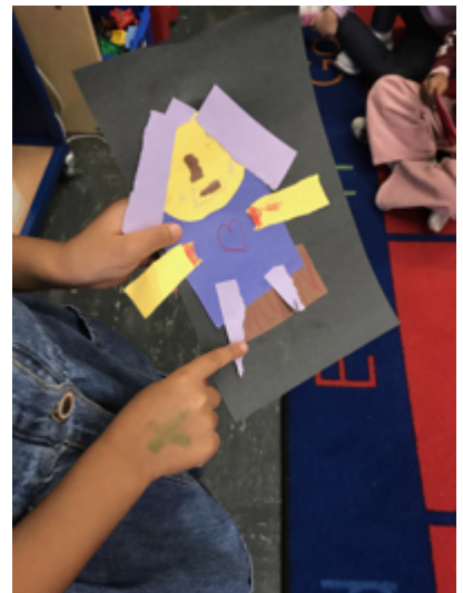
A Kindergarten friend made a paper version of herself.